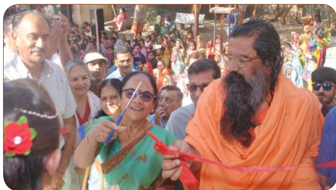
Hasynapur new assembly hall opening

I spent time meeting the Principals and staff of our schools in Chaparda and surrounding district (Anand Dhara Project), Adhoi (Kutchh), Dwarka, Junagadh and Savarkundla. Apart from the school in Dwarka which we are managing on behalf of another trust, all the others are well established now and can boast of some very dedicated and competent leaders. The first sign of a good educationalist is their willingness, eagerness to listen to others and then pick out which new idea would take their school forward. Each Principal was prepared to share honestly where they thought they could improve further. Through our detailed discussions ranging from academic standards to competitive sports, the place of the arts and independent learning to teaching health and hygiene and the environment, we all saw the benefit of