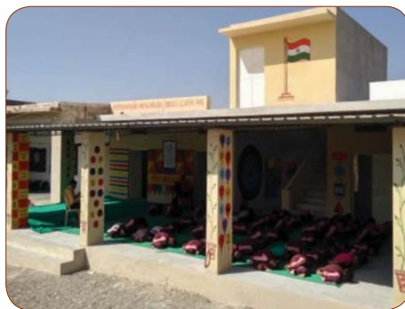
New school in Laskar Shobhagvadla village