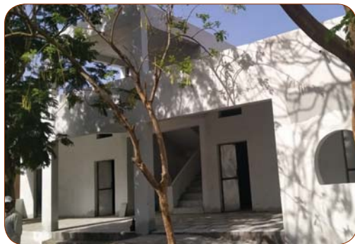
New school in Khambhaliya village.

Since the last newsletter, 9 assembly halls and 2 new schools have been built as part of our Anand Dhara project to develop schools in the villages in Visavadar Taluka.